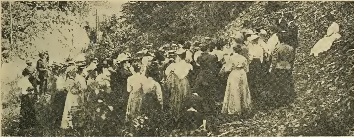
EXCURSION TO STUDY SOIL FORMATIONS

35. Community Co-operation in the Re-directing of the Rural and Village School. This course will include a brief history of the general development of the graded school, its advantages and disadvantages from the standpoint of the country school, present strong and weak phases, present trend, future possibilities, and the constructive assistance which the community may give in the work of re-direction. Five lectures, fourth week